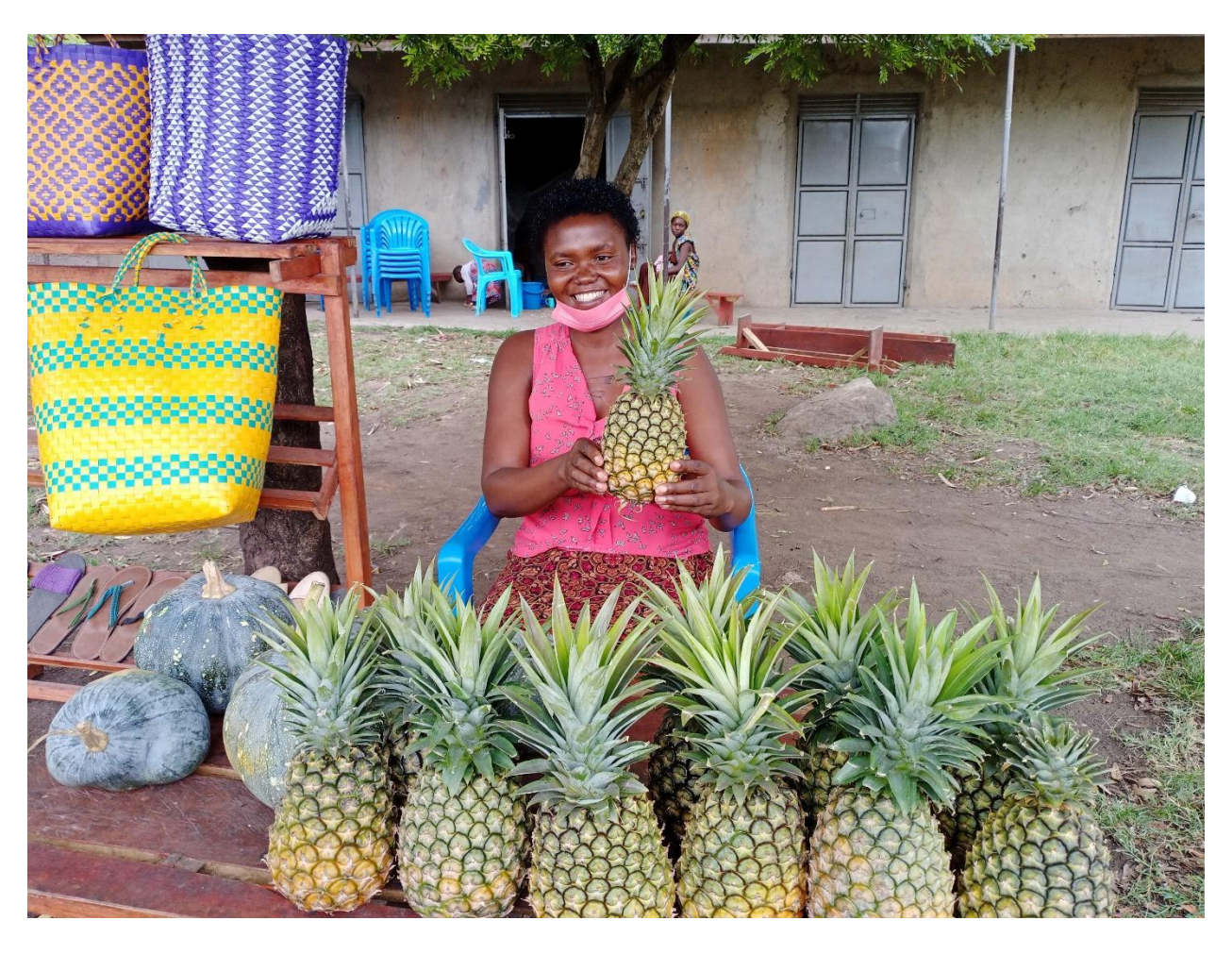
Our Vision: Improved living conditions of rural women in Kasese, Uganda.